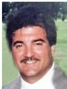
Dino Carlesimo, 60