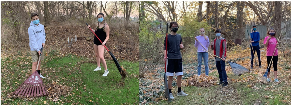
Just a handful of the teens helping. Several not pictured.

To many, those words make no sense. They love to receive. Yet the Lord is not saying that receiving has no pleasure. Many of us have experienced the joy of having someone care for us. Yes, there is pleasure in receiving; yet there is even more pleasure in giving. Jesus is saying that the pleasure of knowing that we have been used by God to help someone, exceeds the pleasure of being the one who was helped.—Taken from Seeds of Faith