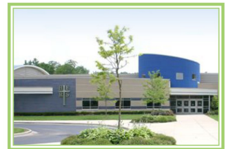
South Campus | Grades 4-8 2633 John R Road Rochester Hills, MI 48307

JESUS CHRIST IS THE REASON FOR OUR SCHOOL