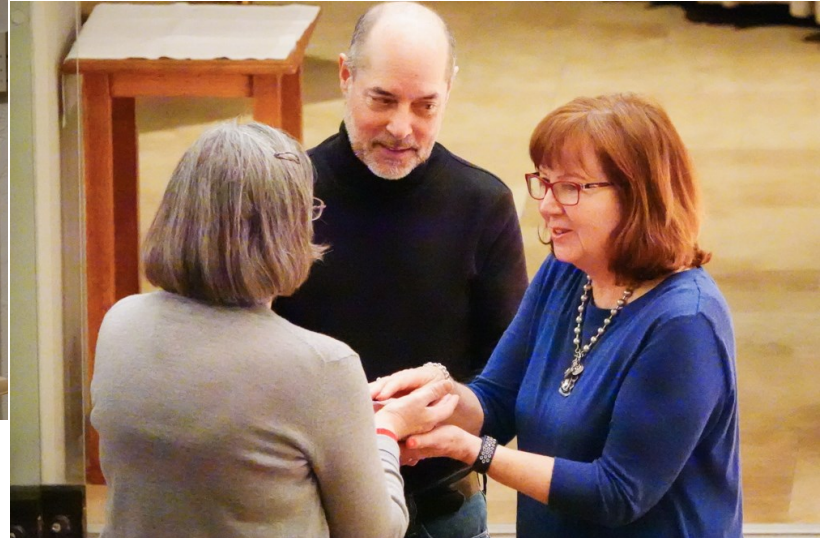
Ritual action use of oil