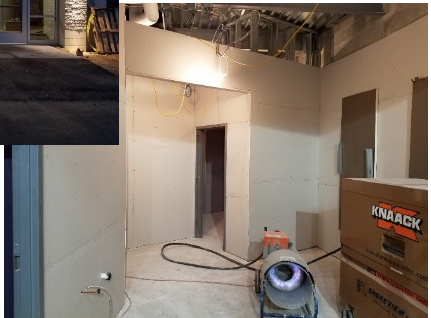
Drywall up in the east vestibule