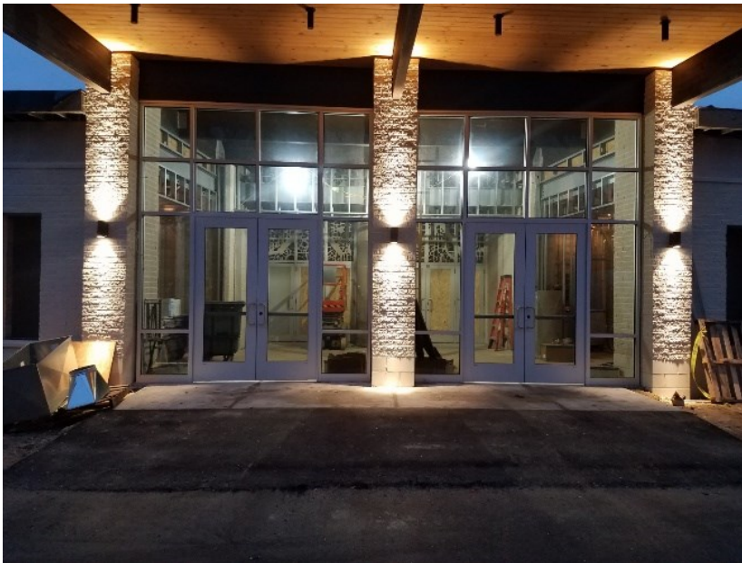
New exterior lighting east vestibule