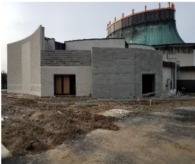
Inside wall for gathering space is complete