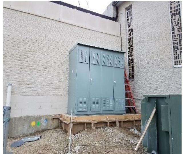
Electrical switch gear for the east vestibule