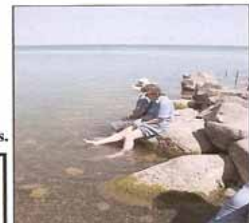
Meditating on the Sea of Galilee